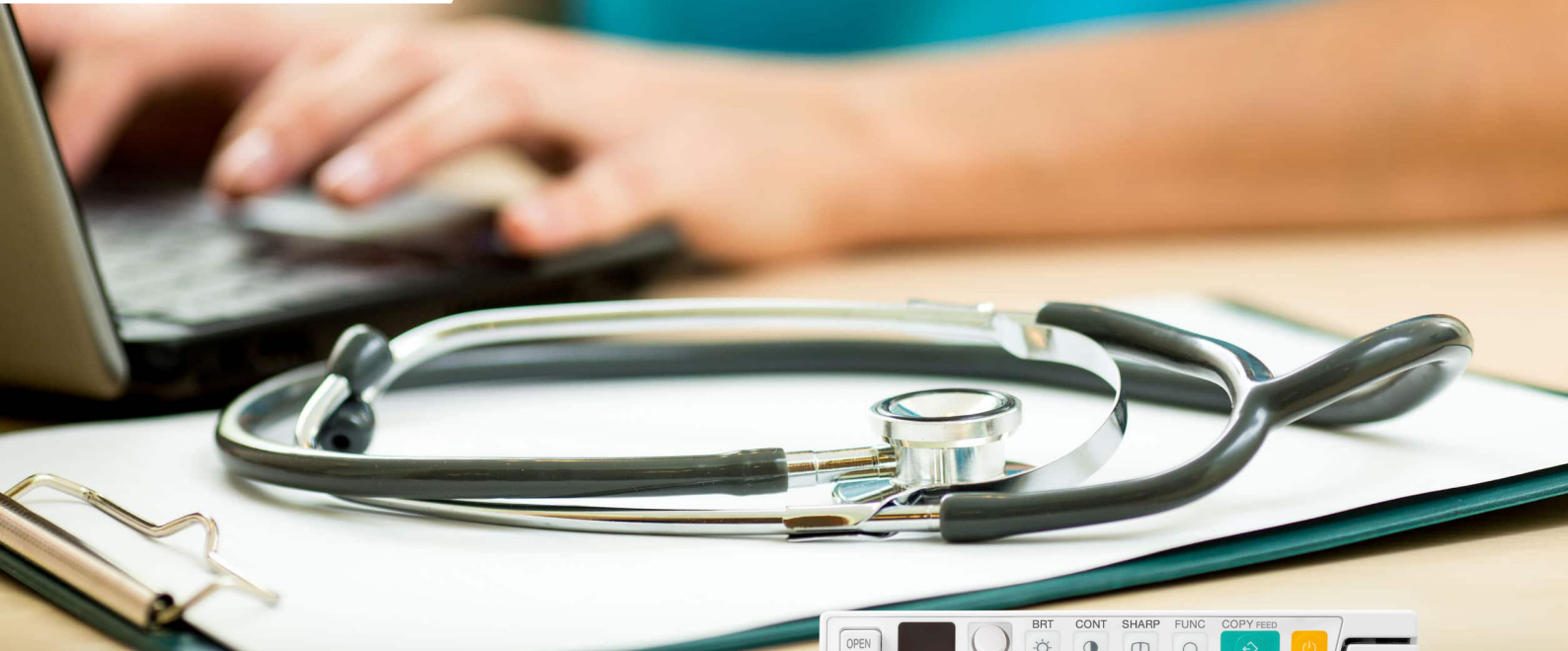
Photo Printing Solutions